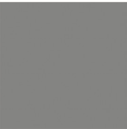
P9 BENJAMIN MOORE, #F705, CINDER