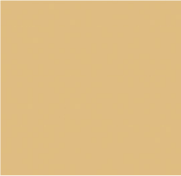
P2 BENJAMIN MOORE, #201, GOLD LEAF