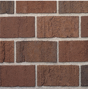
W1 BELDEN BRICK BERWICK BLEND