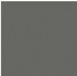
P8 BENJAMIN MOORE, #HC166, KENDALL CHARCOAL