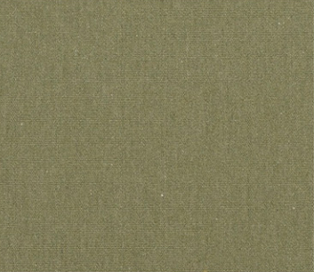
AW1 UNITY LEAF