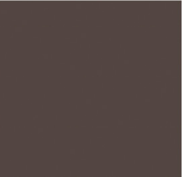
P5 BENJAMIN MOORE, #2115-20, INCENSE STICK