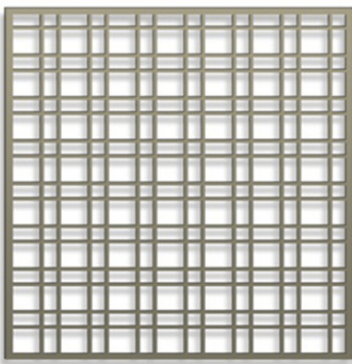
G1 BOK MODERN, PATTERN #C1, COLOR P5, POWDER COAT ALUMINUM