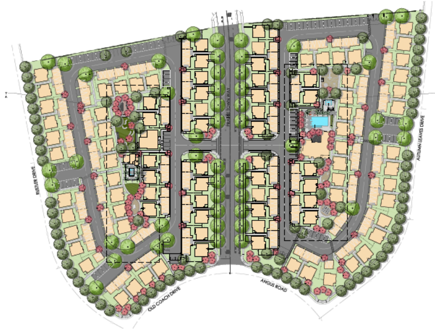
Figure 3: Site Plan