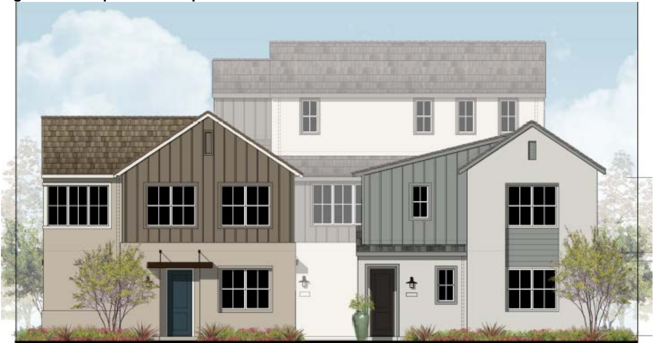
Figure 4: Example Streetscape