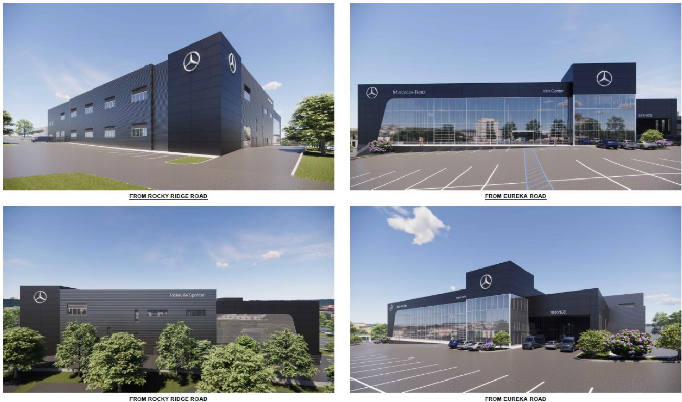
Figure 4: Building Renderings

The building has roofline variation not exceeding 55 feet in height. All sides of the proposed building will be visible from public streets, with the Eureka Road frontage being the most prominent. All sides of the building have been designed to incorporate a mix of colors, materials, and window glazing, as well as wall plane variation. The wall plane and roofline variations provide visual relief and a break in the façade. The building will have roll-up doors on each elevation. The front elevation will feature two glass roll-up doors for the indoor display area that will be incorporated into the curtain wall system, which will visually blend in. The remaining roll-up doors for the service areas are located internal to the site, away from the street frontage, which is consistent with the CDG.