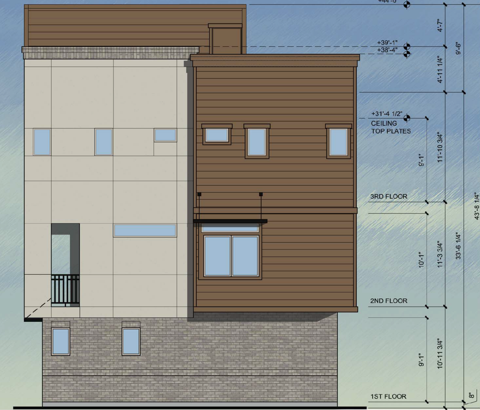
WEST ELEVATION - BUILDING 2 (NEVADA STREET) SCALE 3/16" = 1'-0"