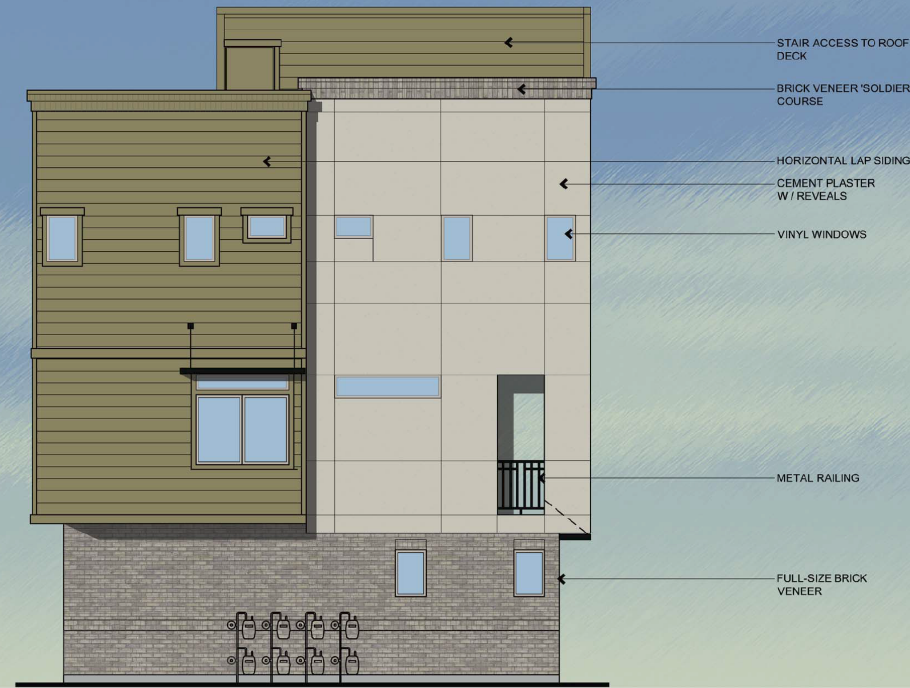
EAST ELEVATION - BUILDING 2 (DRIVE ISLE) SCALE 3/16" = 1'-0"