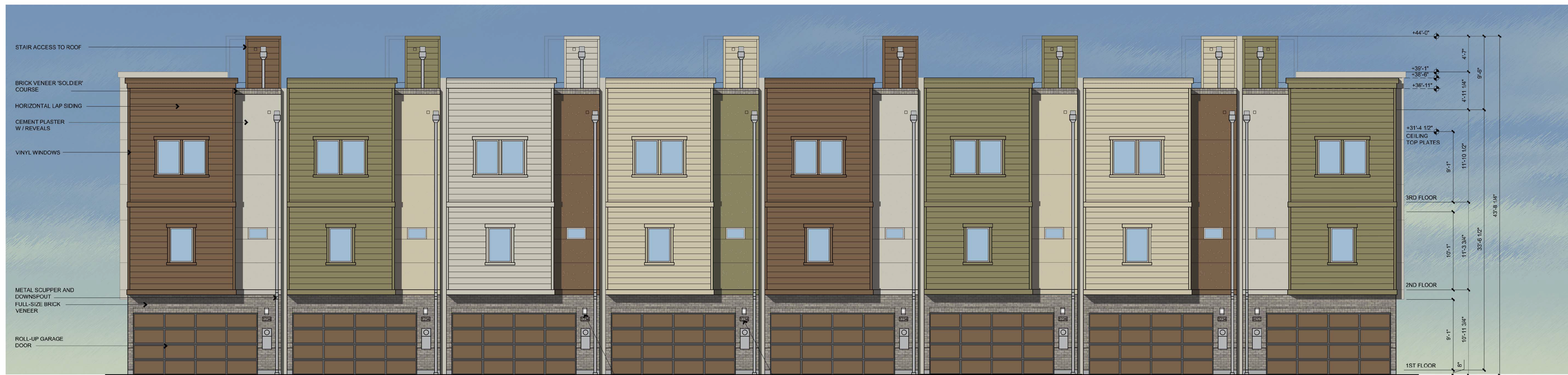
SOUTH ELEVATION - BUILDING 2 (DRIVE ISLE)