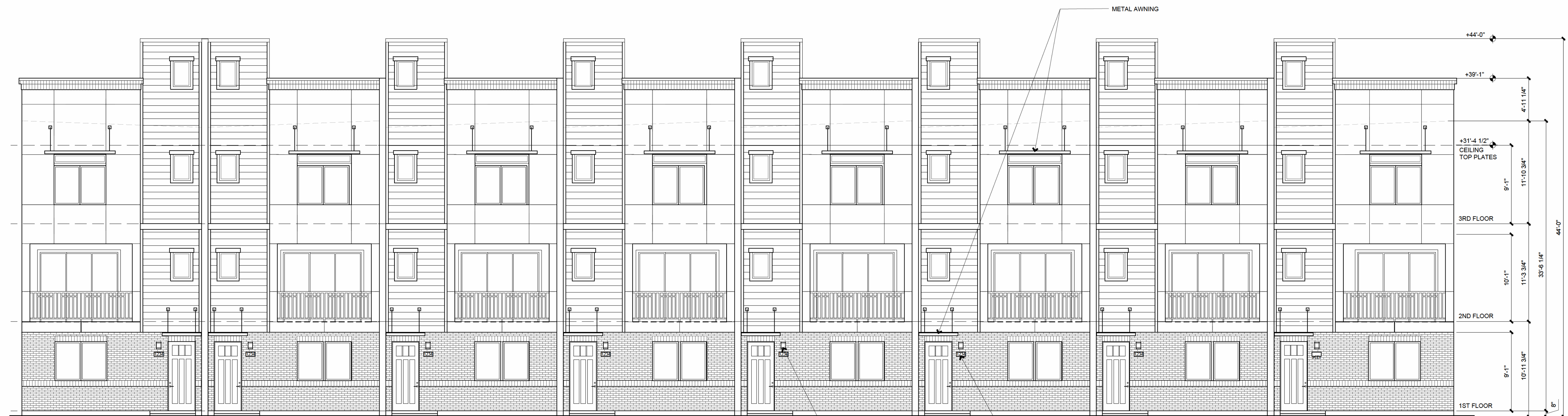
NORTH ELEVATION - BUILDING 2 (PUBLIC / PASEO)