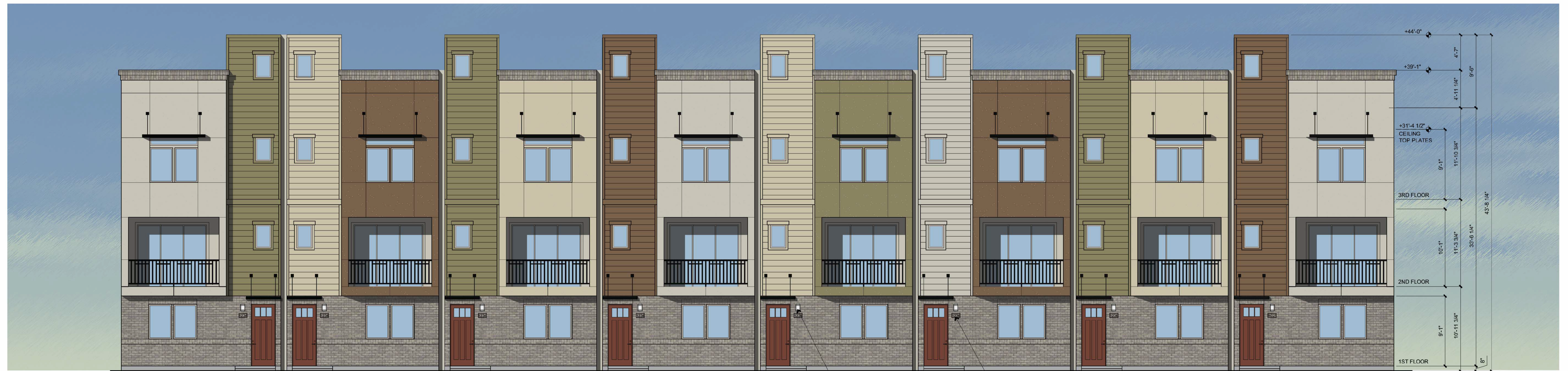
NORTH ELEVATION - BUILDING 2 (PUBLIC / PASEO)